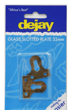
A654 GLASS SLOTTED PLATE 32MM 6002386006540