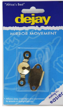
A664 MIRROR MOVEMENT DUMBELL 6002386006649