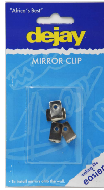
A665 MIRROR CLIP NP 1 HOLE 6002386006656