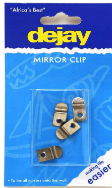
A668 MIRROR CLIP NP CRANKED 6002386006687