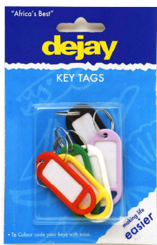
A259 KEY CHAINS ASSTD COLOURS 6002386002597