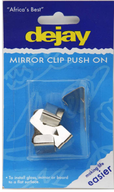
A661 MIRROR CLIP NP PUSH ON 6002386006618