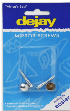
A673 MIRROR SCREWS 2PC 6002386006731