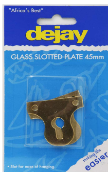
A652 GLASS SLOTTED PLATE 45MM 6002386006526