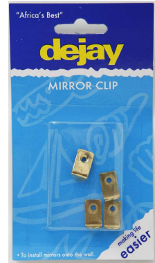
A666 MIRROR CLIP EB 1 HOLE 6002386006663