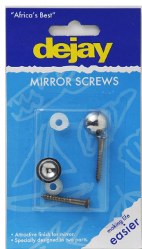
A672 MIRROR SCREWS DOME AND COLLAR 2PCE 6002386006724