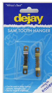
A662 SAW TOOTH HANGER SMALL 2PCE 6002386006625