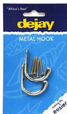
A116 COAT HOOK 6002386001163