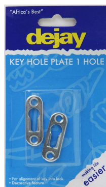
A671 KEY HOLE PLATE 1 HOLE 6002386006717