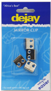
A667 MIRROR CLIP NP 2 HOLE 6002386006670