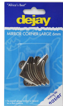
A670 MIRROR CORNER LARGE 6MM 6002386006700