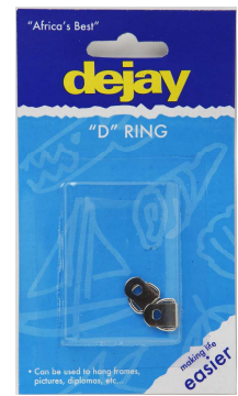
A656 D RING MINI 6002386006564