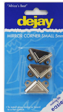
A669 MIRROR CORNER SMALL 5MM 6002386006694