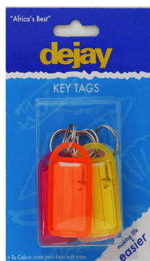
A258 CLICK TAGS ASSTD COLOURS 6002386002580