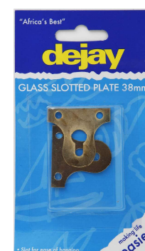
A653 GLASS SLOTTED PLATE 38MM 6002386006533