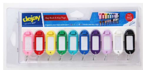
A105 CLICK TAG ORGANISER 6002386001057