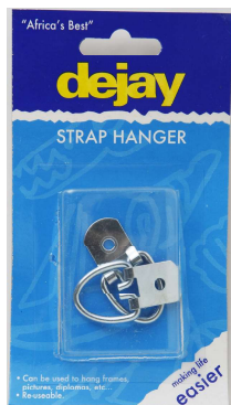
A659 STRAP HANGER MEDIUM 6002386006595