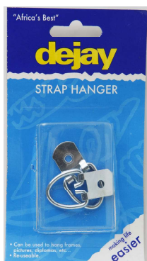
A658 STRAP HANGER SMALL 6002386006588