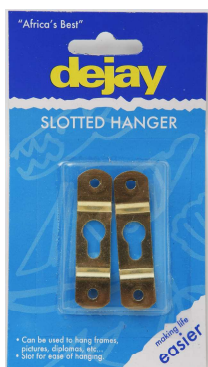
A663 SLOTTED HANGER 2PCE 6002386006632