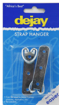
A660 STRAP HANGER LARGE 6002386006601